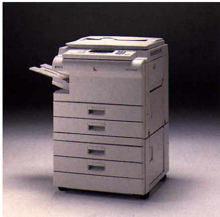
FT4622 with options