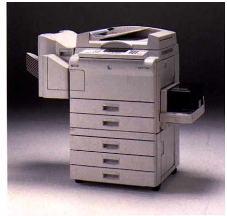
FT4822 with options